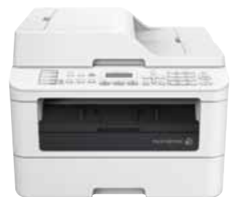
DocuPrint M225 z 4-in-1 Wireless Multifunction Laser Printer