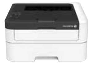
DocuPrint P225 d Network Laser Printer