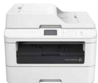
DocuPrint M265 z 4-in-1 Wireless Multifunction Laser Printer with single pass Duplex Automatic Document Feeder and 2.7" colour touch screen