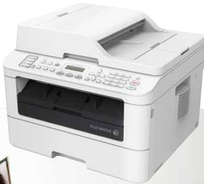
DocuPrint M225 z 4-in-1 Wireless Multifunction Laser Printer