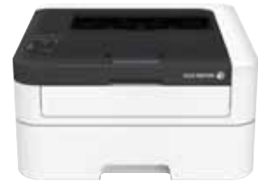
DocuPrint P265 dw Wireless Laser Printer