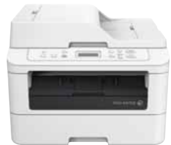
DocuPrint M225 dw 3-in-1 Wireless Multifunction Laser Printer